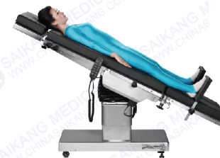
Reversed Trendelenburg: 0-22°