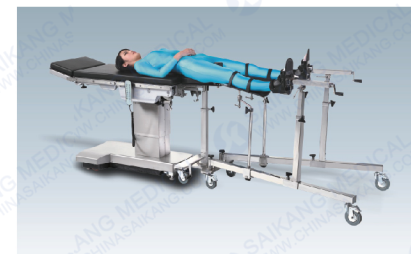
Optional traction 1006