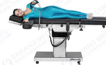
Optional Lateral Arm Support