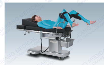
Optional basin for gynecology