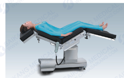
E.N.T. Operation position