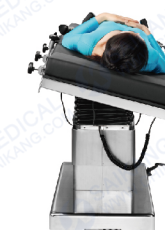
Lateral Tilt Right: 0-20°