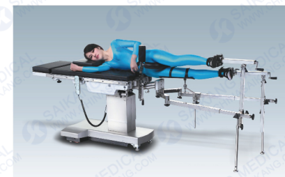
Optional 1005 lateral lying position