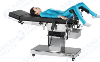
Optional Waste Basin for Gynecology