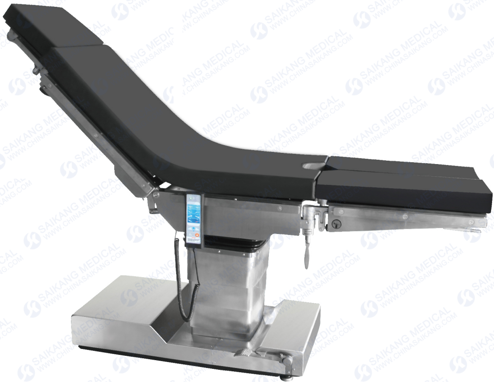
Electric Operating Table A106-2

Name: SKF-C Electric Operating Table Introduction: Electric operation table is made specially to meet demand of sitting posture operations with a extra low position.It adopts full 304 stainless steel,excellent properties on anti-rust.Tabletop is X-raying available.