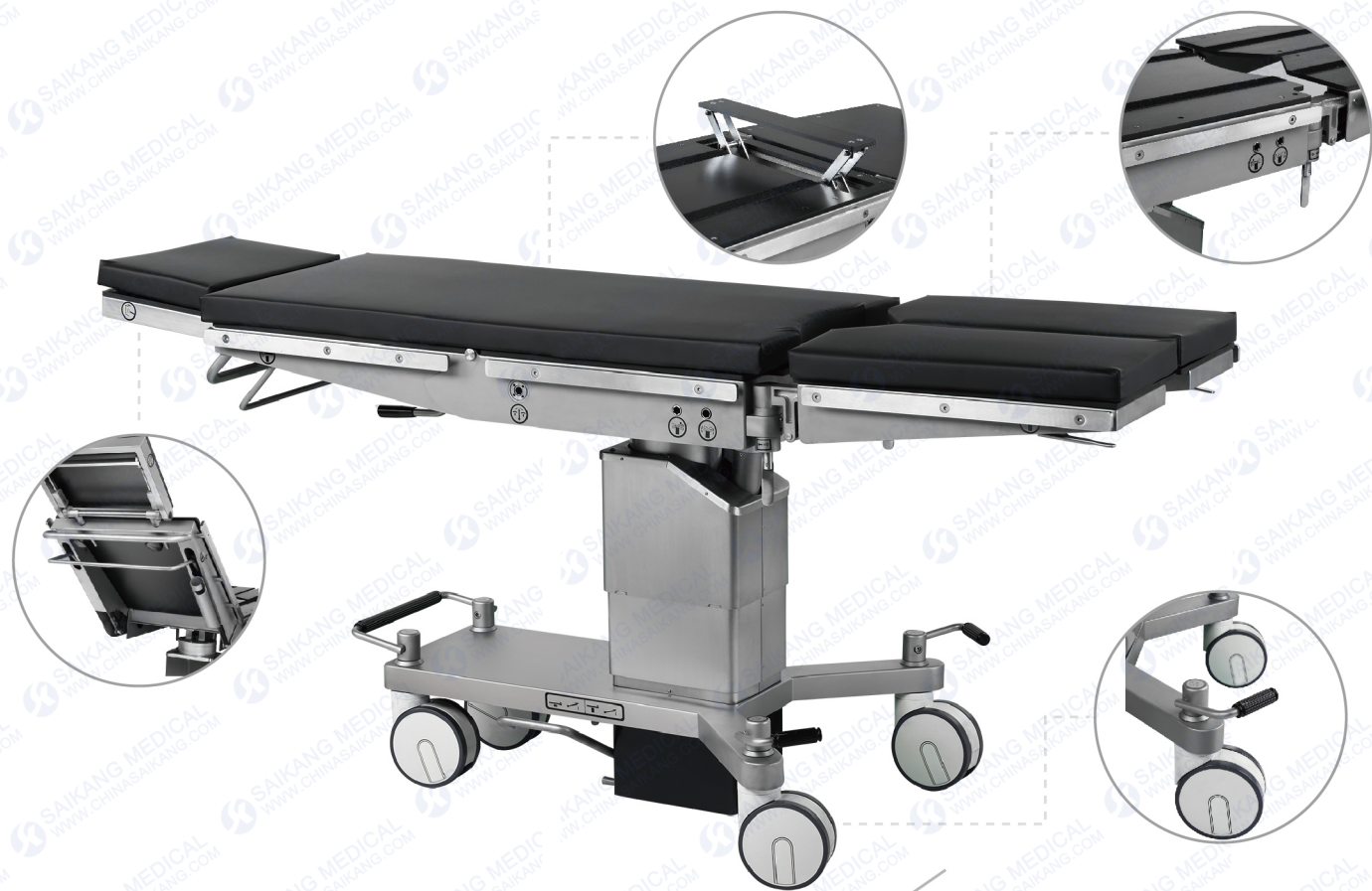
Manual Hydraulic Operating Table A3001-6

Name: SKF-C Manual Hydraulic Operating Table