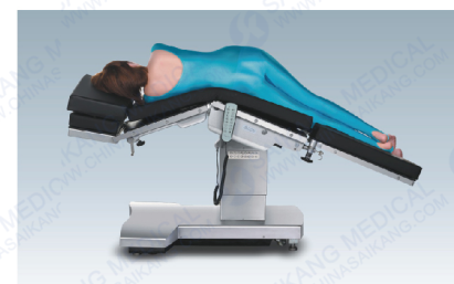
Lateral lying position for chest, kidney,cholecyst operation