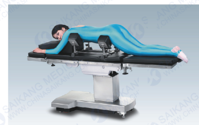
Optional spondyle operating holder