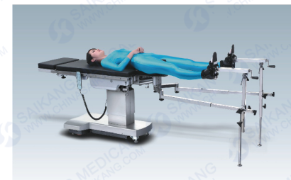
Optional traction 1005 supine position