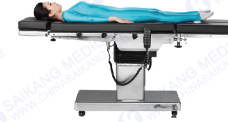
Lateral Tilt Right: 0-20°