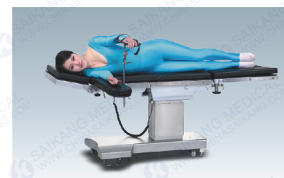
Optional lateral arm support