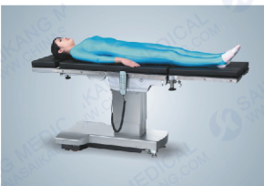
Tabletop headward sliding / toward leg sliding