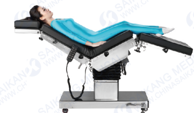
Lateral Tilt Left: 0-20°