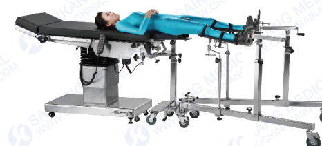
Optional Orthopedics Traction Frame