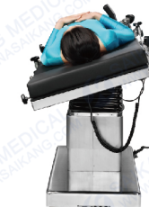
Lateral Tilt Left: 0-20°