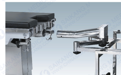
Joint for 1005