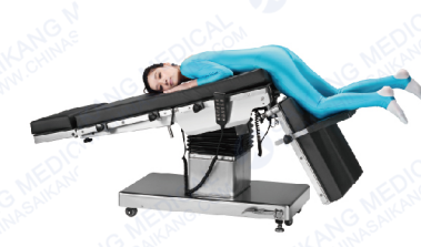
Anorectum Operation Position