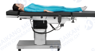
Longitudinal adjustment: 0-295mm