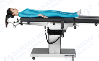
Optional Head Rest