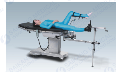
Optional 1005 Tibia bone-nailing position