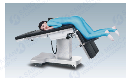
Anorectum operation position