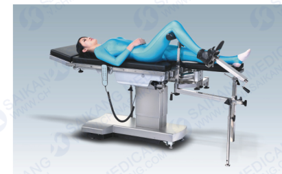
Optional 1005 Tibia extension position