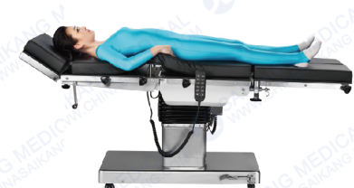
Kidney bridge elevation: 0-80mm